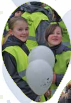
The students in the primary and secondary schools gather for the opening of the 200th Jubilee.