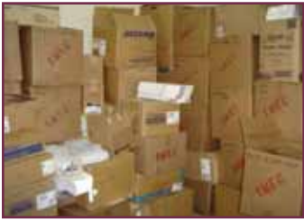
The shipping containers with furnishings and equipment arrive from IMEC.

refurbish and send to deprived countries throughout the world surplus medical equipment and supplies from hospitals, rehabilitation clinics and laboratories in eastern Massachusetts. Medical personnel, such as doctors, nurses, hospitalists, and community helpers volunteer at least one day a week to sterilize, sort and categorize this discarded surplus equipment for export to underprivileged countries. Administrators at the IMEC facility, located in North Andover, MA, offered hospital supplies, furnishings and equipment for the Clinic.